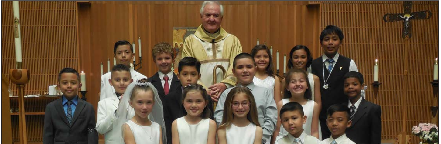
First Communion from April 23, 2016 9:30 am Mass (top) and 12 Noon Mass (below).