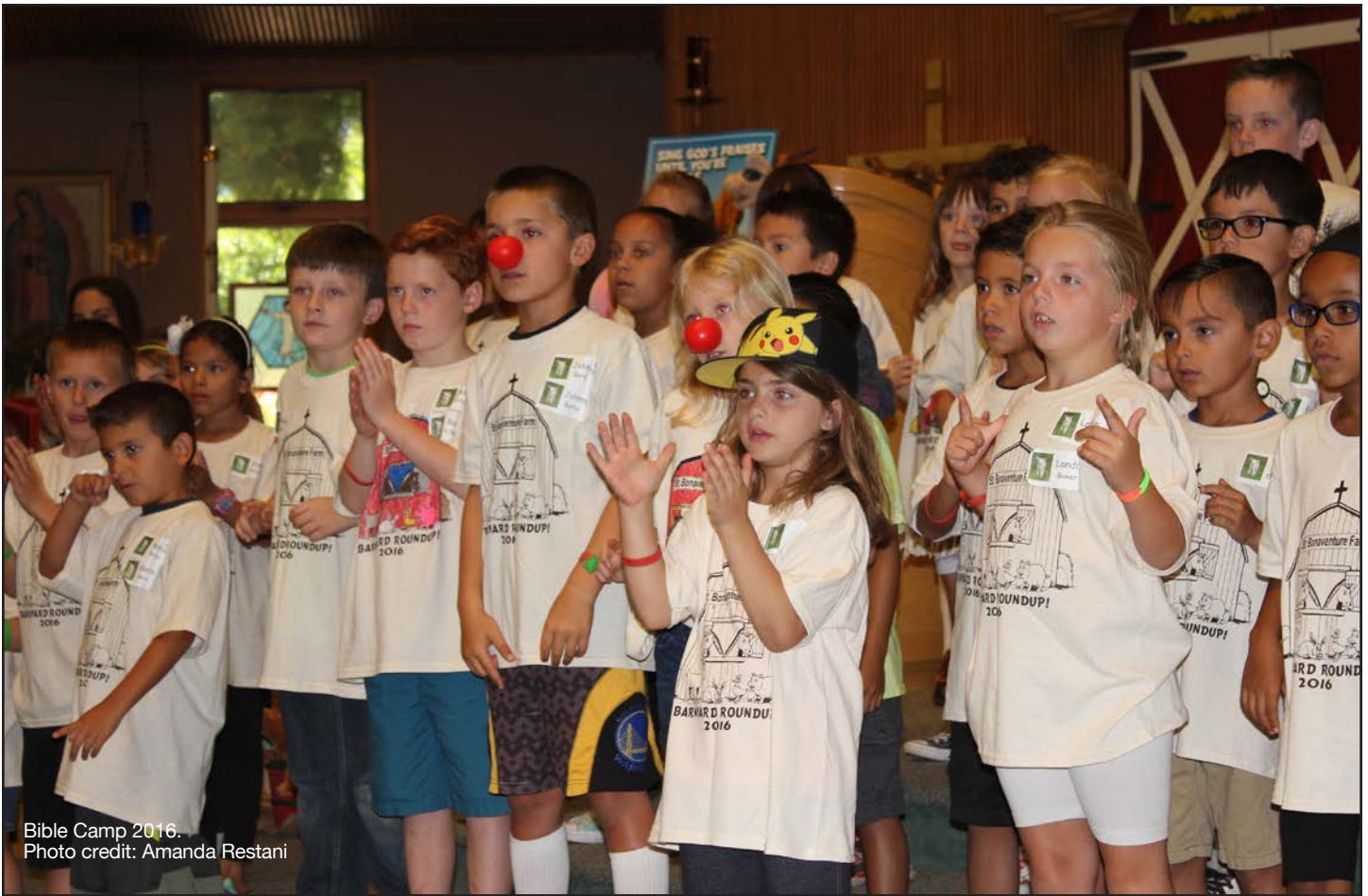
Bible Camp 2016.