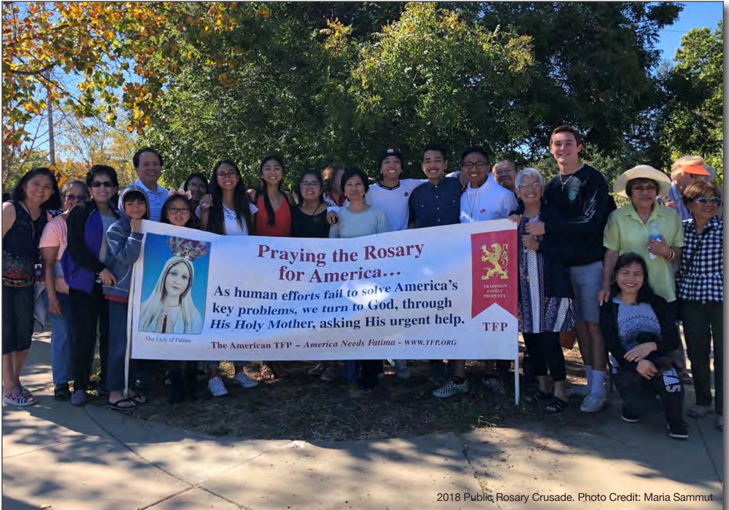
2018 Public Rosary Crusade.

5562 Clayton Road, Concord, CA 94521 • PHONE (925) 672-5800 • FAX (925) 672-4606 • www.stbonaventure.net