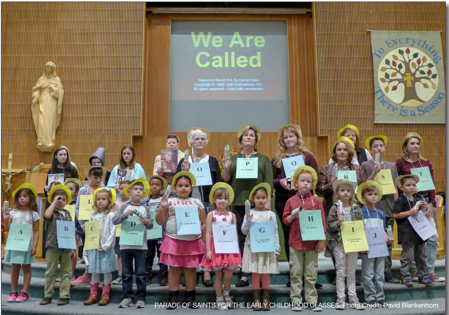
PARADE OF SAINTS FOR THE EARLY CHILDHOOD CLASSES.

5562 Clayton Road, Concord, CA 94521 • PHONE (925) 672-5800 • FAX (925) 672-4606 • www.stbonaventure.net