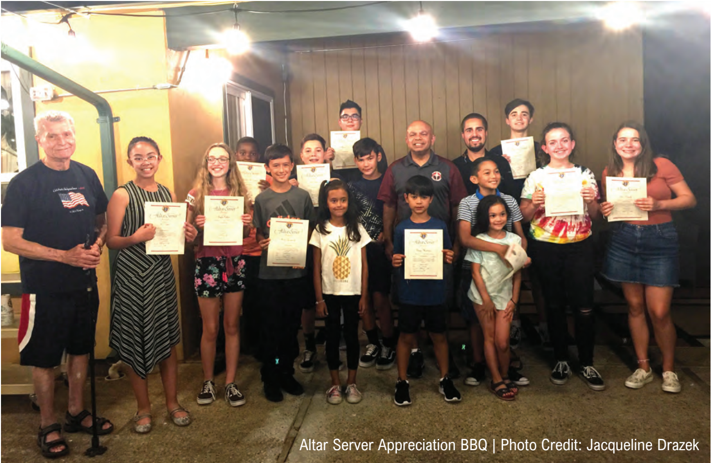
Altar Server Appreciation BBQ

5562 Clayton Road, Concord, CA 94521 • PHONE (925) 672-5800 • FAX (925) 672-4606 • www.stbonaventure.net