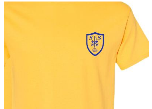
Front of yellow shirt