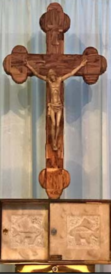
Newly installed 'Daily Mass Chapel' cross purchased in the Holy Land