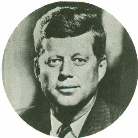
John Fitzgerald Kennedy