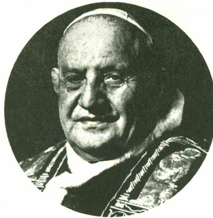
Pope John XXIII