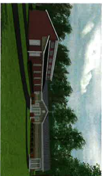
Rendering of our NEW Building

Thank you for your support of the new St. Mary's Religious Education and Parish Life Center