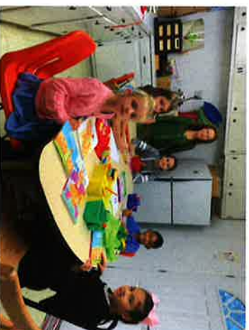
WE need more space!