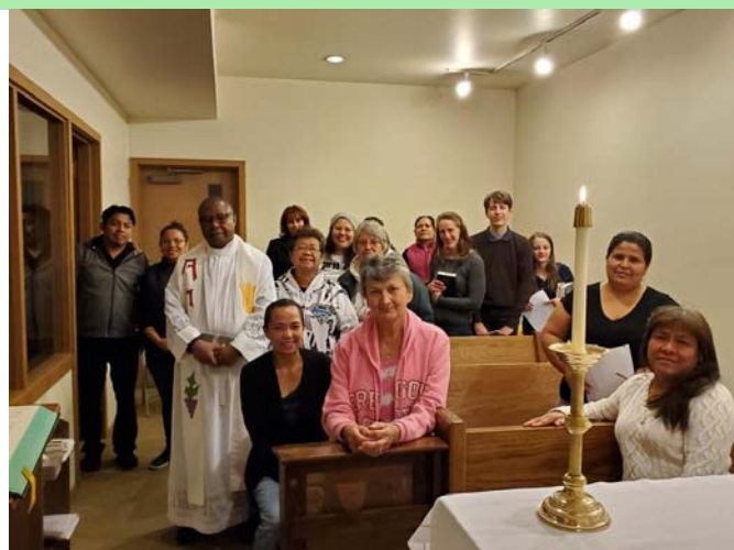
Wednesday night Adoration

This year, the Christmas Bazaar will allow outside vendors. The cost is $25 per table for parishioners and $30 for general public. Vendor applications can be found at https://stfredericchurch.org/christmas-bazaar or in the office.