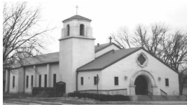
SACRED HEART CATHOLIC CHURCH Seymour, Texas

SACRED HEART PASTORAL CENTER 206 N. CEDAR ST. SEYMOUR, TX 76380-2102 OFFICE (940) 889-5252 FAX (940) 889-2136