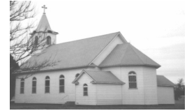
ST. MARY OF THE ASSUMPTION CATHOLIC CHURCH Megargel, Texas

SACRED HEART PASTORAL CENTER 206 N. CEDAR ST. SEYMOUR, TX 76380-2102 OFFICE (940) 889-5252 FAX (940) 889-2136