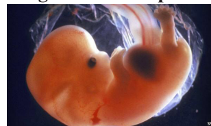
7 week old "fetus"

O Blessed Mother, you received the good news of the incarnation of Christ, your Son, with faith and trust. Grant your protection to all pregnant mothers facing difficulties. Guide us as we strive to make our parish communities places of welcome and assistance for mothers in need. Help us become instruments of God's love and compassion. Mary, Mother of the Church, graciously help us build a culture of life and a civilization of love, together with all people of good will, to the praise and glory of God, the Creator and lover of life.