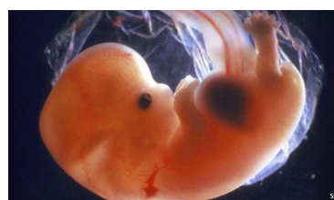
6-7 week old "fetus"

El fin de semana del 22 de Febrero, una vez mas tendremos la oportunidad de caminar con otros como Jesus nos pide que hagamos. Unidos como Catolicos el Llamado es una forma en que todos podemos ayudar de una manera poderosa. Muchos de nuestros hermanos y hermanas de nuestro estado han sufrido desastres naturales catastroficos. Otros todavia luchan al margen de las comunidades. Recordemos que cada uno de nuestros regalos realmente hacen una gran diferencia en la vida de alguien.