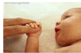
Take my hand, not my life.