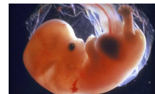
7 week old "fetus"