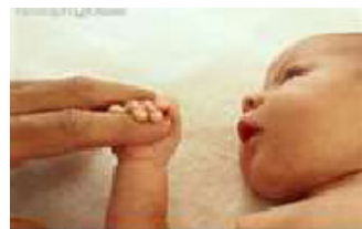
Take my hand, not my life.

Ahora ofrecemos el Sacramento de la Reconciliación los Jueves y Sabados a las 5:30pm en el gimnasio. La línea estará afuera para mantener la distancia social.