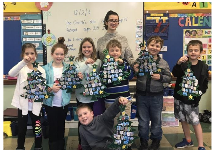
Children in grade 3 celebrated the beginning of Advent by lighting the first candle on the Advent wreath. To get ready for the birth of Christ they made a Jesse tree which helps us remember the people who prepared the way for Jesus. The name comes from Isaiah 11:1 which says: "A shoot will come up from the stump of Jesse: from his roots a Branch will bear fruit" – Isaiah 11:1