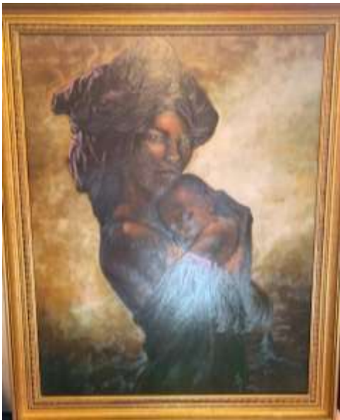
"My Child, My Child"