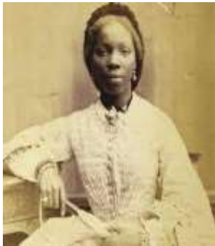
Phillis Wheatley ~ 1753-

'Twas mercy brought me from my Pagan land, Taught my benighted soul to understand That there's a God, that there's a Saviour too: Once I redemption neither sought nor knew. Some view our sable race with scornful eye, "Their colour is a diabolic die." Remember, Christians, Negros, black as Cain, May be refin'd, and join th' angelic train.