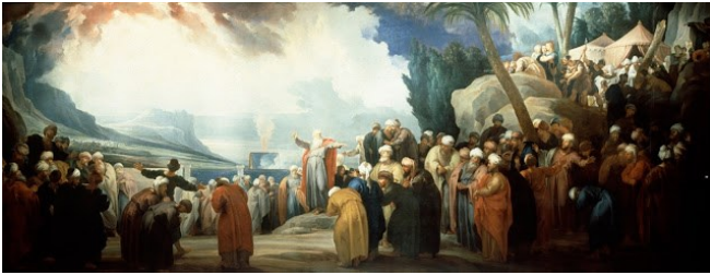
Moses elects the council of seventy elders Jacob de Wit (1695-1754)