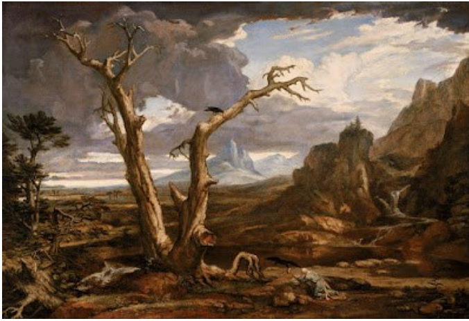
Elijah in the Desert Washington Allston (1779-1843)

In place of the pastor's note this week, please enjoy this excerpt from The Imitation of Christ by Thomas à Kempis.