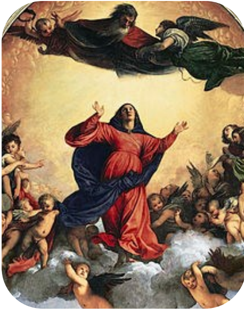
Assumption of the Virgin Titian (c. 1515-1518)

On this, the Feast of the Assumption, please enjoy the Angelus address from the Holy Father from 2019: