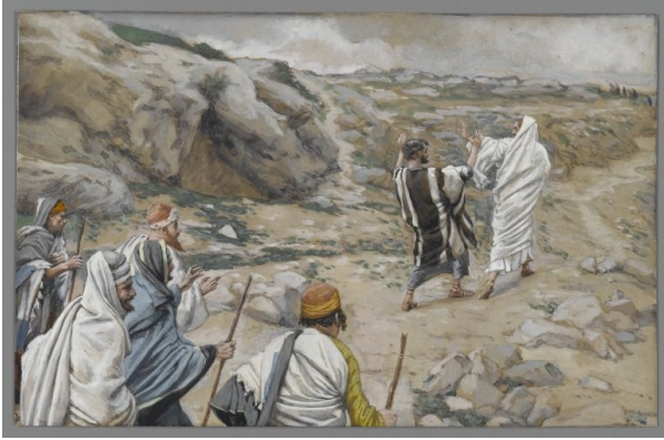
Get Thee Behind Me, Satan James Tissot (1836-1902)