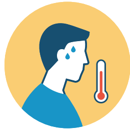
FEVER 100.4* *or school board policy if threshold is lower