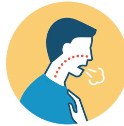
SHORTNESS OF BREATH OR DIFFICULTY BREATHING