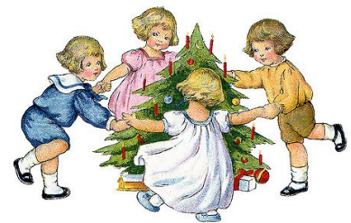
A Joyful Christmas

Your generosity goes a long way in helping those who are less fortunate to not only enjoy the holiday, but to learn that they are loved.