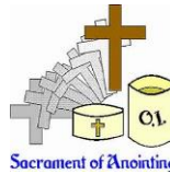
Sacrament of Anointing

October is Right to Life month. As in the past, a Mass of the Anointing will be held on Saturday October 19 th at 12 noon. Light refreshments will be served after Mass.