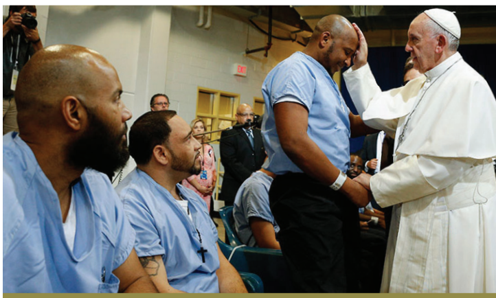
Pope Francis blesses an inmate at the Curran-Fromhold Correctional Facility in Philadelphia in September, 2015.

“ Be mindful of prisoners as if sharing their imprisonment... —Hebrews 13:3