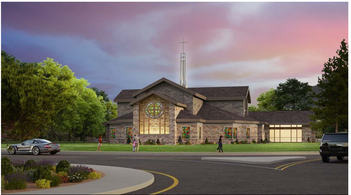
VIEW FROM TRAFFIC CIRCLE CHURCH OF THE MOST BLESSED SACRAMENT FRANKLIN LAKES, NJ DECEMBER 21, 2020