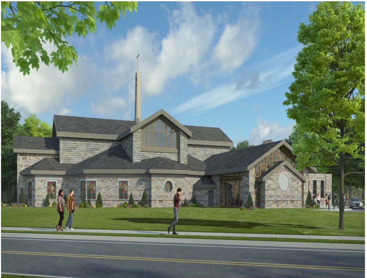
VIEW FROM FRANKLIN LAKE ROAD CHURCH OF THE MOST BLESSED SACRAMENT FRANKLIN LAKES, NJ DECEMBER 21, 2020