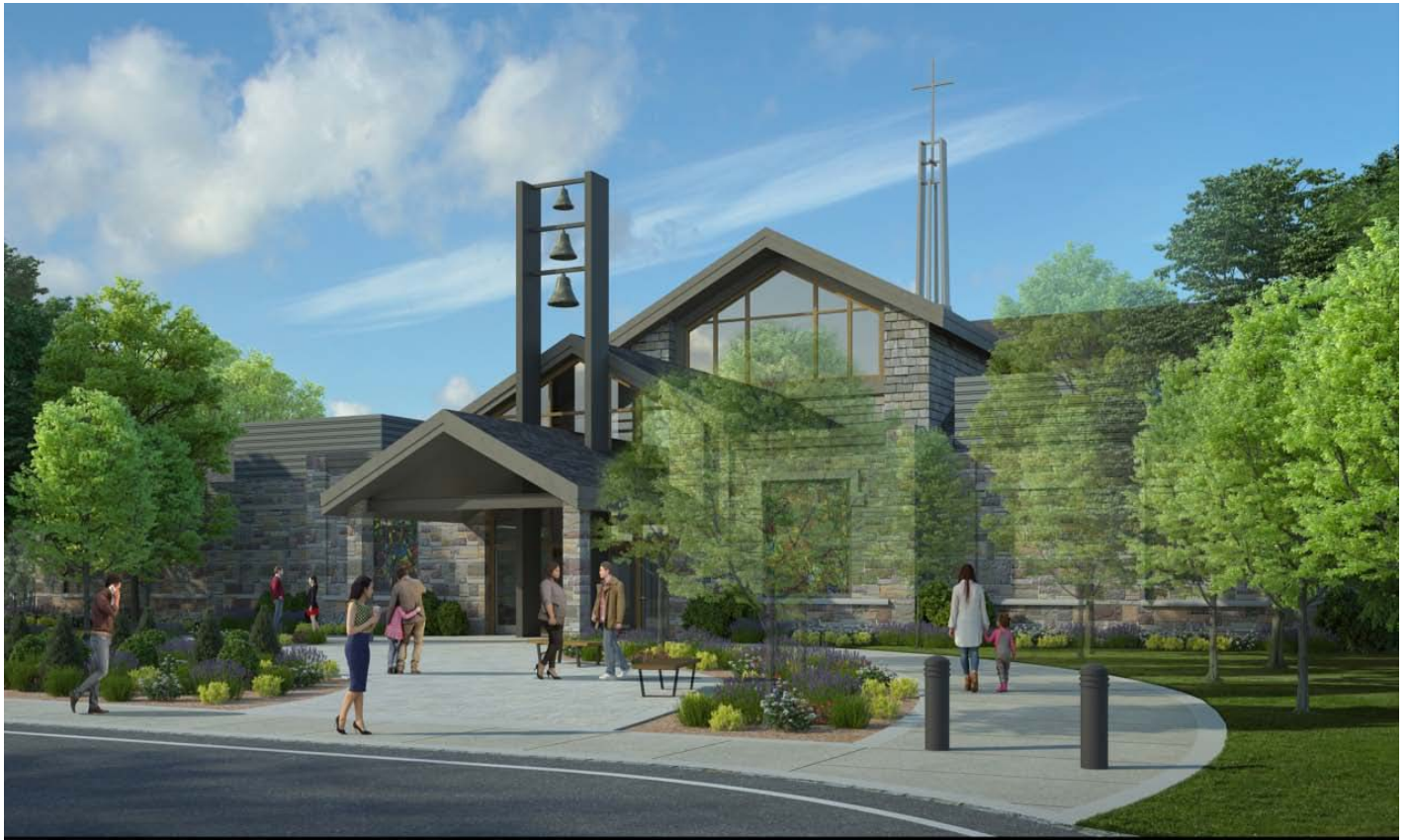
VIEW AT MAIN ENTRANCE CHURCH OF THE MOST BLESSED SACRAMENT FRANKLIN LAKES, NJ DECEMBER 21, 2020