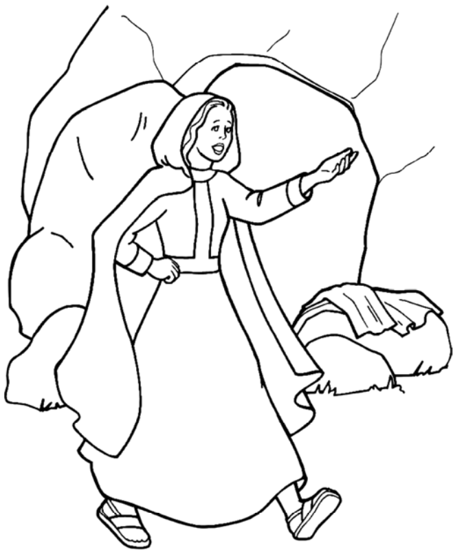
“They have taken the Lord from the tomb.” John 20:2