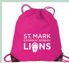
Cinch Bag (hot pink, gray or green) - $10.00