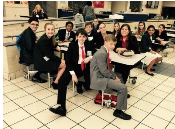
5th Grade @ The Pines: