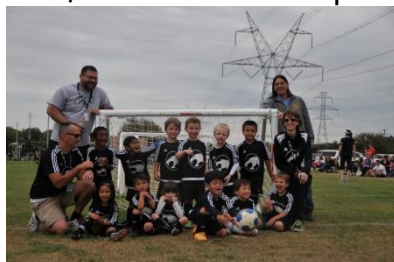
TK/K Santa Cams:

The Jesuit Rangerette drill team is hosting a Winter Dance Clinic on December 10 from 8:30 AM-1:00 PM at Jesuit for students in Kindergarten through 6th grade. Santa will make an appearance. Register here , or click here for information.