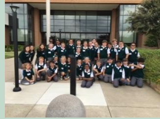
PK3 Community Helpers: