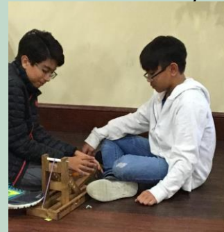
4th Grade STEM-Marble Runs: