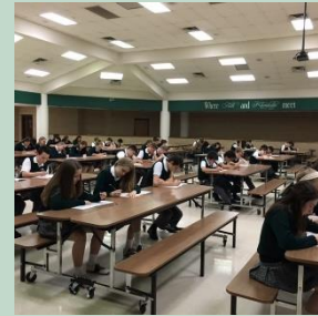
Boy Scouts-Order of the Arrow:

Wishing our entire St. Mark community a blessed and Happy Easter!