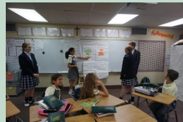
PK-4 Resurrection Rolls: