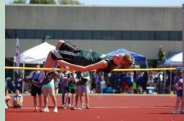
4th Grade at the Perot: