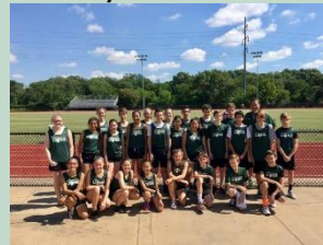
Varsity Track MVP & Female Athlete of the Year: