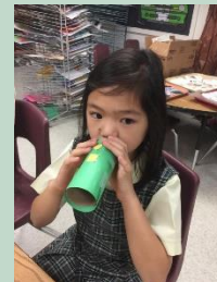
1st Grade Beach Blanket Reading: