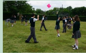
Prayer Partner Farewell: