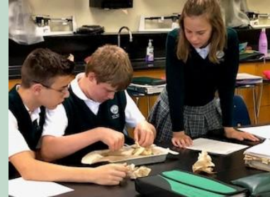
1st Grade Magnets: