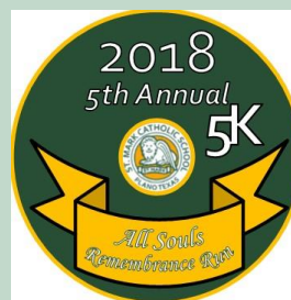
October 2018 All Souls 5K Run

*Can you lend your talents to the 2018-19 Athletics Department fundraising events? We can use your assistance!