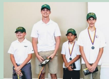
The JV Golf team placed 2nd in the DPL Golf tournament.