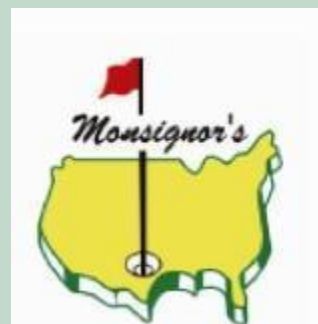
May 2019 Monsignor Smyth Golf Classic.