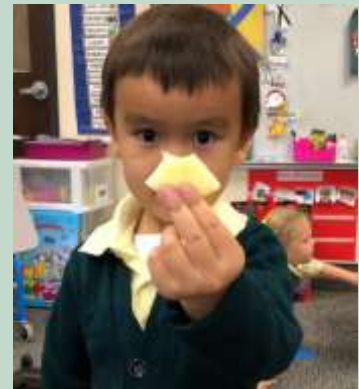
2nd Grade Reconciliation: