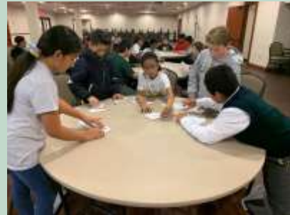
4th Grade Marble Runs: