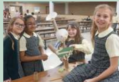
3rd Grade Saint Reports: