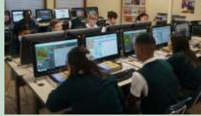
JPII Visits Middle School: