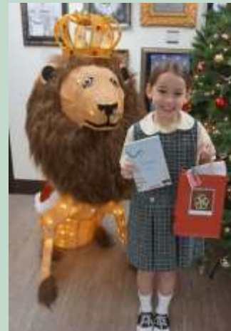
Hour of Code: