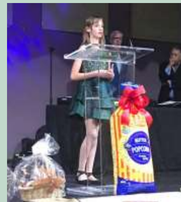
Staff Wacky Tacky Christmas Day & Party: