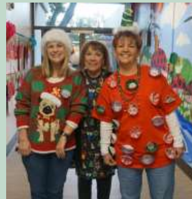
Catholic Charities Volunteers: