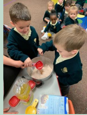
PK3 D Week: