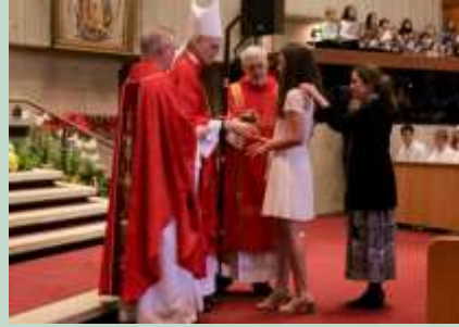
2nd Grade First Communion: