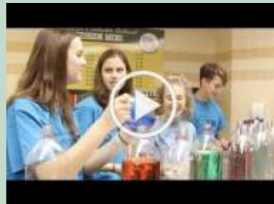
St Mark STEM Fair

Check out the YouTube video produced by John Paul II High School highlighting St. Mark alumni and their ongoing support of the STEM Fair: