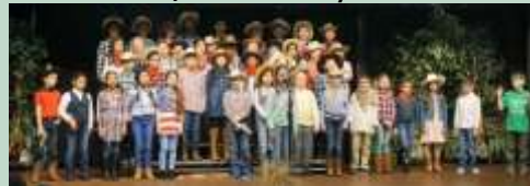
Middle School Spring Musical: