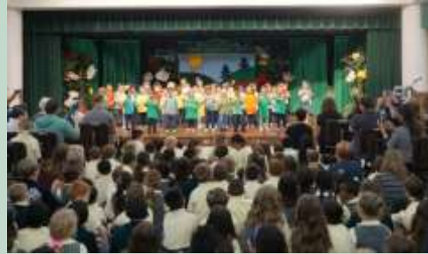
4th Grade Play:

* Gap Fund - This fund helps St. Mark bridge the gap between the tuition amount our families pay,