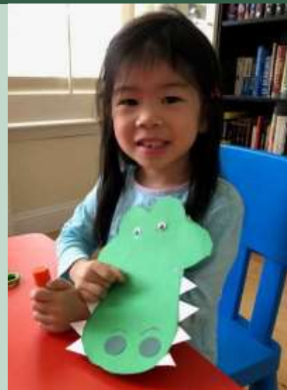
PK3 Outdoor Fun: