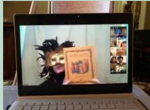
PK4 Summer Countdown: