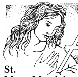
St. Mary Magdalene

All involved in any Ministry at SMM are particularly invited to attend this Mass to be recognized for their generous contributions to our parish.