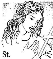
St. Mary Magdalene