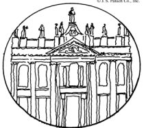
The Dedication of the Lateran Basilica

There are all sorts and kinds of birthday parties. Church buildings, as well as the people who use them, have anniversaries for their beginnings. On November 9th , it is for Our Savior's Basilica and Saint John's Baptistery, the pope's cathedral as bishop of the people of Rome. We belong to the "Roman family" in the church, so it is our feast too. Celebrate the Lord's coming! God's people are truly the place of Christ's presence in this world. We would all do well to celebrate the birthday of our own church or parish or community of faith and acknowledge Christ's presence with thanks.