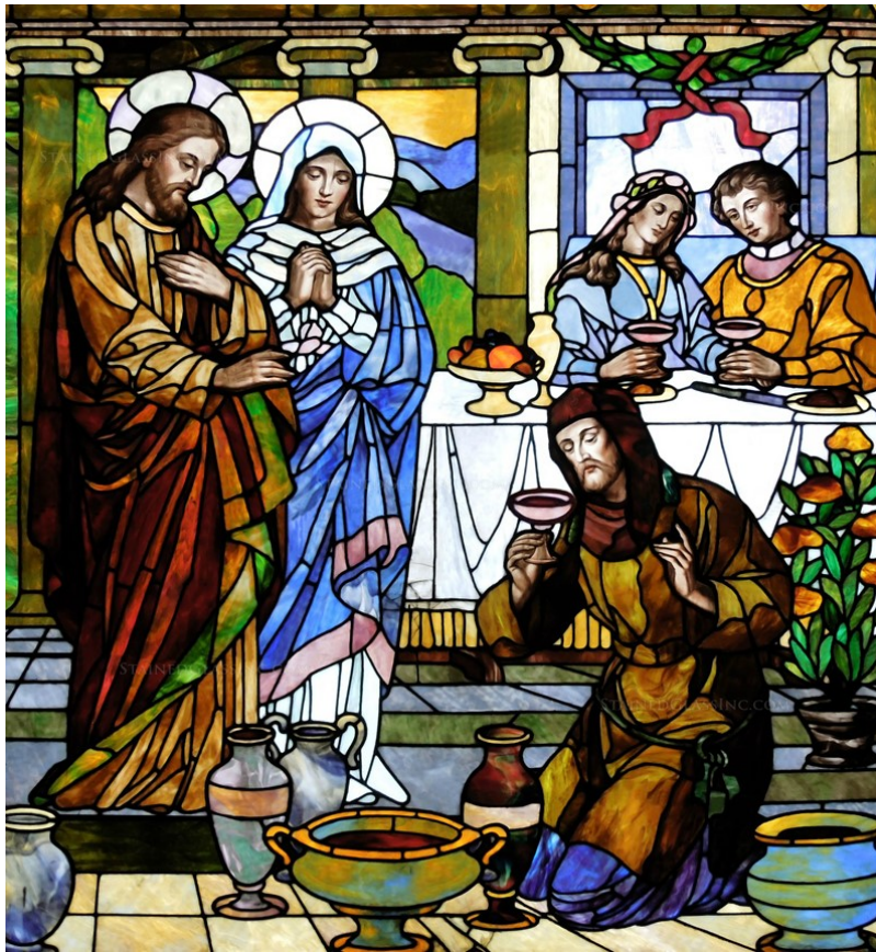
The Wedding at Cana (John 2)