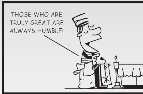
22ND SUNDAY IN ORDINARY TIME